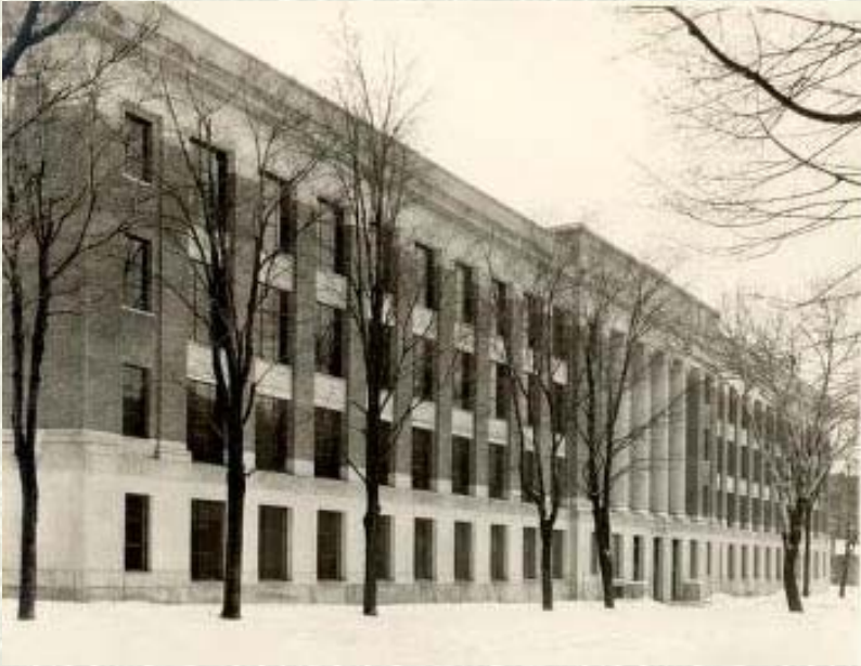
Medical School built in 1925 on E. University. Albert Kahn, architect.