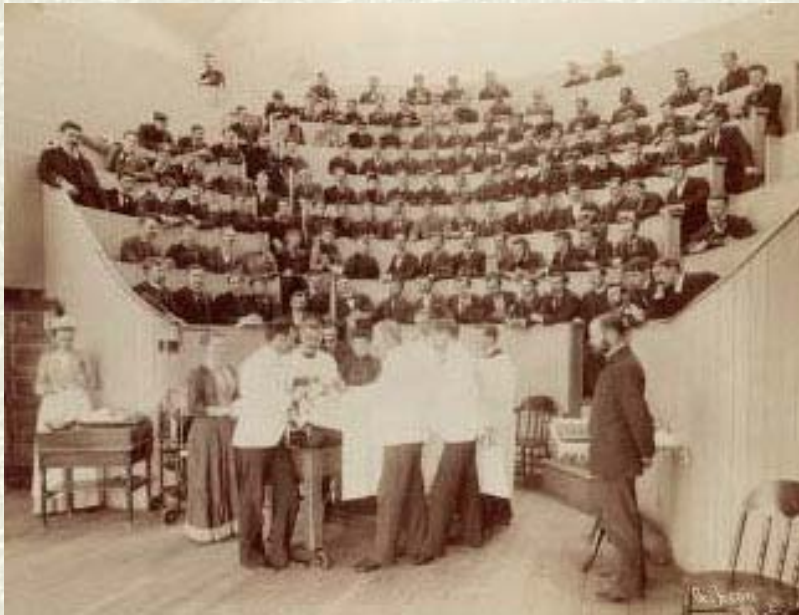
Medical School lectures; surgery and anatomy classes, ca. 1893