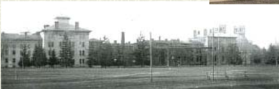
Medical School and old Library, ca. 1904