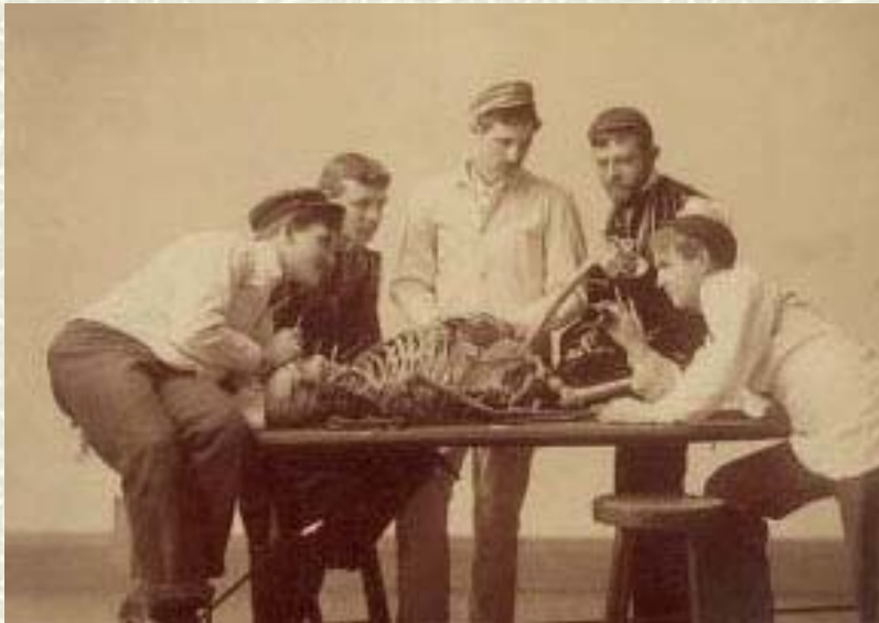
Surgery and Anatomy class, 1893.